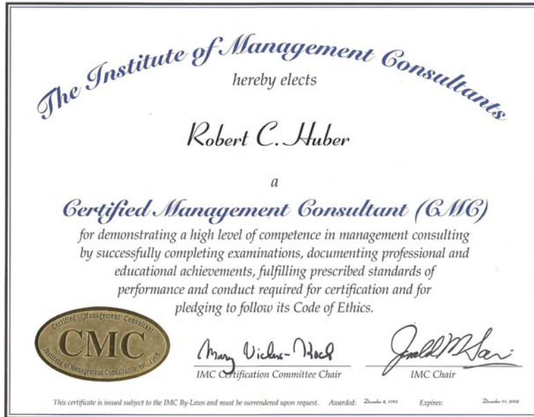
Certified Management Consultant (C.M.C.) 1996